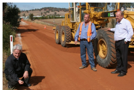
BRL's Mooliabeenee road upgrade, examined by Chittering Shire officials and BRL's Operations Manager.

BRL has undertaken significant work to the Mooliabeenee Road used by the haul trucks to take bauxite from the trial mine site to the Mooliabeenee rail siding. This trial operation aggravated existing road weaknesses and the company have repaired 1.2 km of road cement stabilisation and asphalt over the whole damaged section.