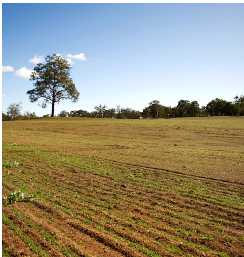
Rehabilitated trial site north Bindoon June 2010