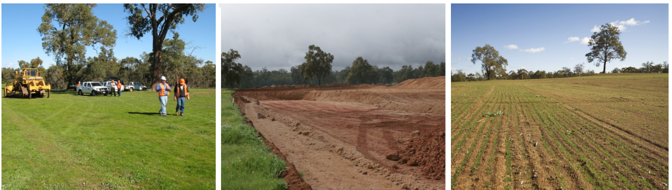
North Bindoon trial site showing land before trial mining, during mining and current rehabilitation to pasture .