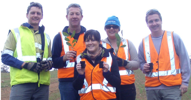
BRL's Environmental and Land Access team replanting trees on the north Bindoon trial rehabilitation site June 2010

As part of BRL's DSO strategy, it made an application to the Environmental Protection Authority (EPA) in December 2009 to mine and export 1.2Mt of bauxite on privately owned Minerals to Owner (MTO) farmland in North Bindoon. The EPA set the level of assessment for the proposed six month mining operation as a Public Environmental Review. BRL had not anticipated that the operations which were the subject of its application would generate environmental impacts warranting this level of review, and appealed the EPA's assessment. The appeal itself took several months. BRL consulted with government departments and a number of experts and external consultants before deciding to withdraw the appeal and original 1.2Mt application.