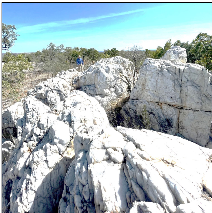
White Springs Quartz Occurrence in Far North Queensland (ASQ 100%)