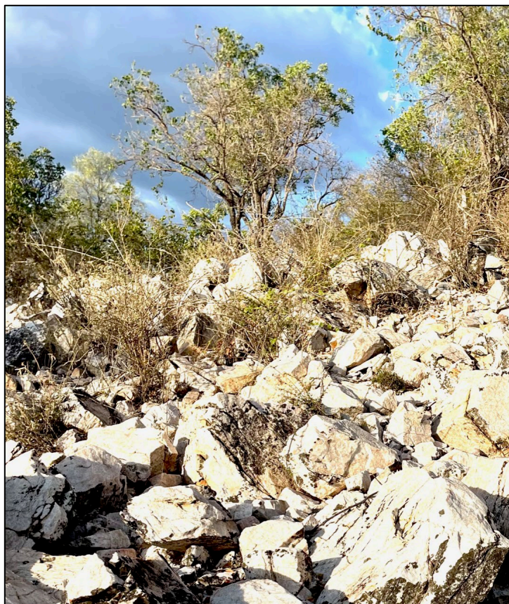
Quartz Hill EPM 26702 (ASQ 100%)

Previous explorers have reported a historic resource of 14Mt at 99% SiO 2 for Quartz Hill.