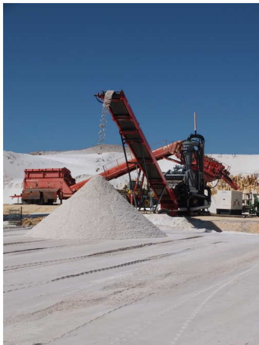
Operating Plant at Urban's Maralla Road Deposit

As Urban Resources Pty Ltd ("Urban") is a private company, it has never had a requirement to complete a JORC resource. Urban has been operating the mine for the last 5 years.