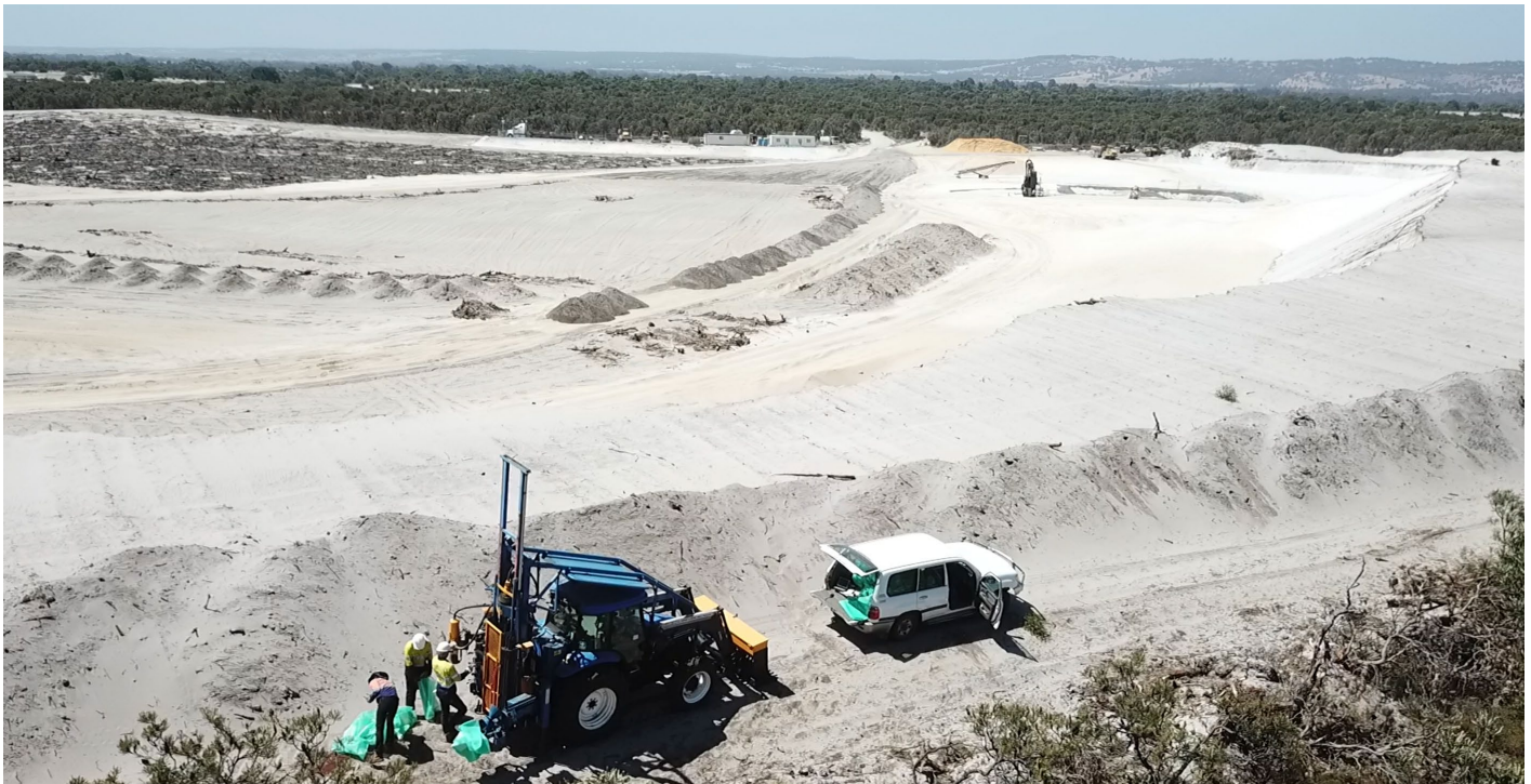
Figure 3: BRL vacuum drilling at Urban's Maralla Road Silica Sand Deposit next to Urban's existing operation